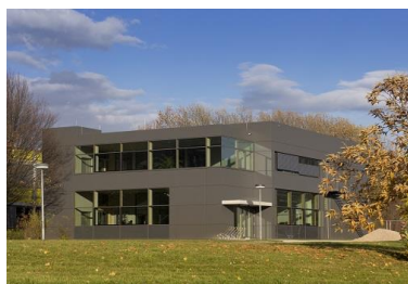
Peter Osypka Institute for Pacing and Ablation