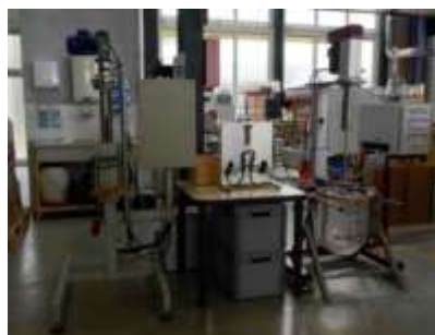
Stirred Tanks (3 and 30 Litres)