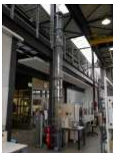
Particle Falling Velocity Column